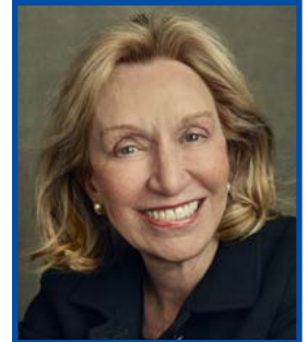
DORIS KEARNS GOODWIN, PhD Author and Historian